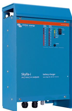
Skylla-i 24/100 (1+1)

To learn more about batteries and charging batteries, please refer to our book 'Energy Unlimited' (available free of charge from Victron Energy and downloadable from www.victronenergy.com ).