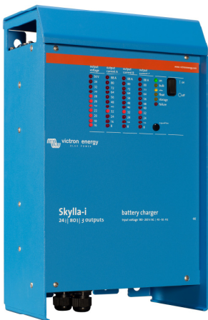
Skylla-i 24/100 (3)