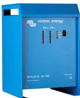
Skylla TG 24 100