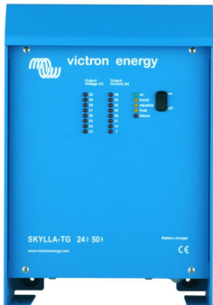
Skylla TG 24 50