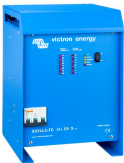
Skylla TG 24 50 3 phase

To learn more about batteries and charging batteries, please refer to our book 'Energy Unlimited' (available free of charge from Victron Energy and downloadable from www.victronenergy.com ).