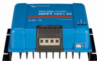
Solar charge controller MPPT 150/35